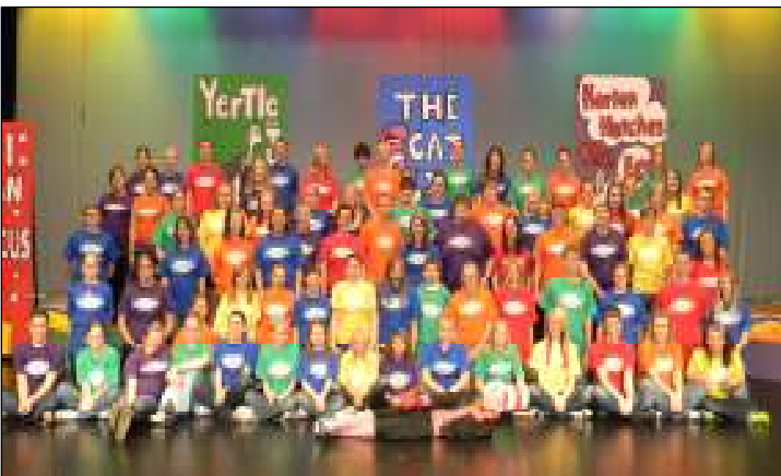
The Cast of Seussical would like to thank everyone who came to watch their performance on November 12 th & November 13 th . We appreciate your support. Our upcoming JH/HS Choir Christmas Concert is on Sunday, December 4 th at 3 pm in the auditoria.