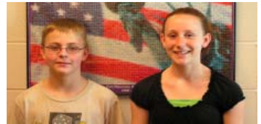
Fort Recovery Middle School's MARCH PRIDE WINNERS!