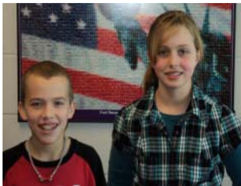
December Winners -